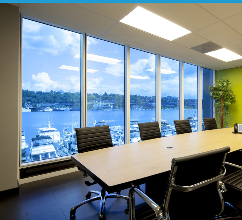
Pictured above: Lake Union, Wash. office building with secondary window upgrade